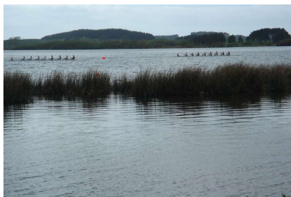
Open Eights Finish

Almost perfect conditions all day. Five Wellington Assoc. clubs joined by a combined team from Picton and Wairau RC's and the Interprovincial crews made for a day of intense rivalry and great rowing. Around 34 races were completed and on a day of mostly flat water very few crews including the coxed ones managed to steer between the buoys marking the course. I'm not sure if this means the course had a dogleg in it or individuals require GPS Navigation built into their brains. As a result many crews rowed longer races than they needed to. With one point separating the top two clubs the last race of the day –Men's Open 8, became critical. Finally Star won from Wellington with a one point margin